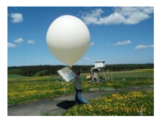
Figure 2: Weather balloon being launched

It carries various weather instruments, and travels high into the sky recording the state of the atmosphere at different levels.