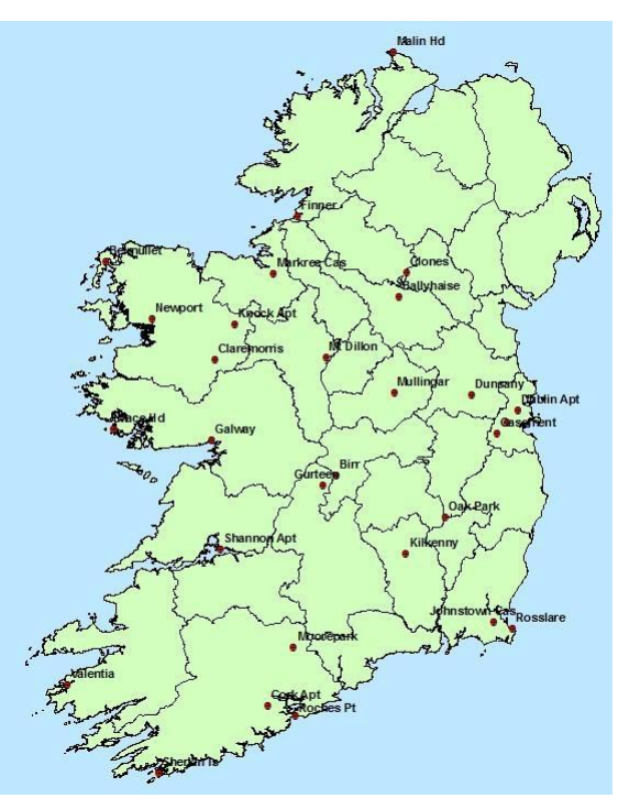
Figure 1: Map of weather stations in Ireland

The readings are then coded into a special numeric language.